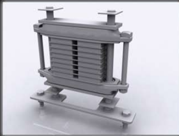
Truck components including brake rigging parts