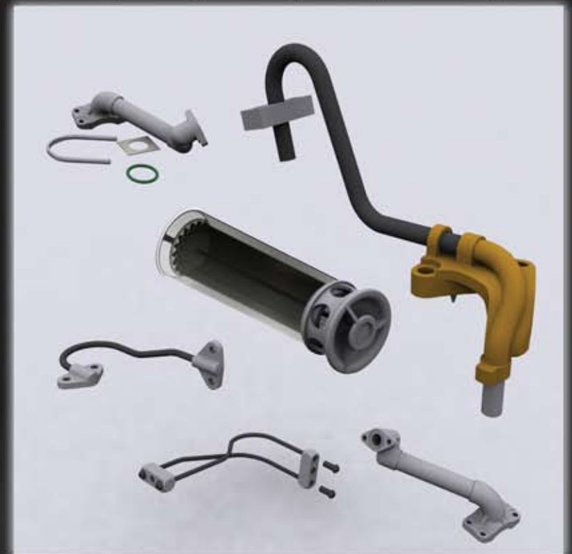
Engine components featuring new designs

Amfab products and quality assurance standards are certified to the rigorous criteria set by the American Association of Railroads (AAR) M-1003 Specification